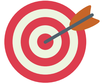
Adopted from Achieving the Dream, SMARTIE ACTION PLAN GOAL SETTING TEMPLATE