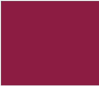
Pantone (PMS) #208