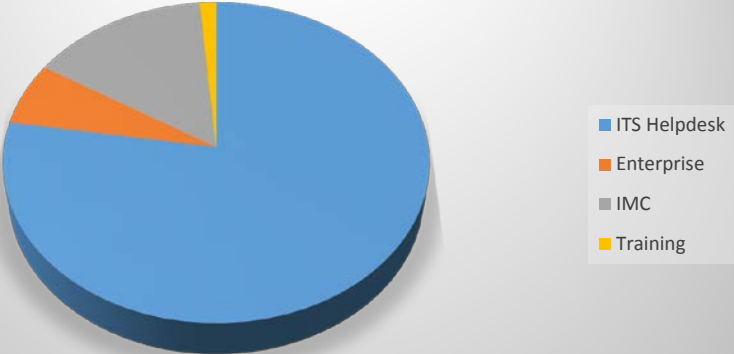
6 Month Closed Ticket Distribution