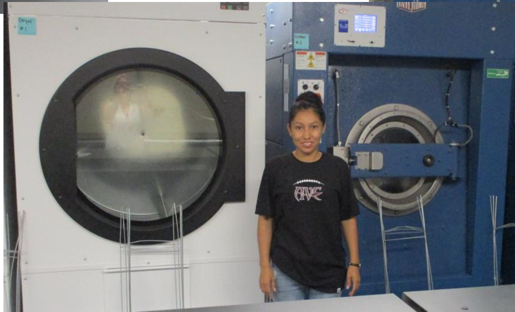
A student staff member to visually see the scale