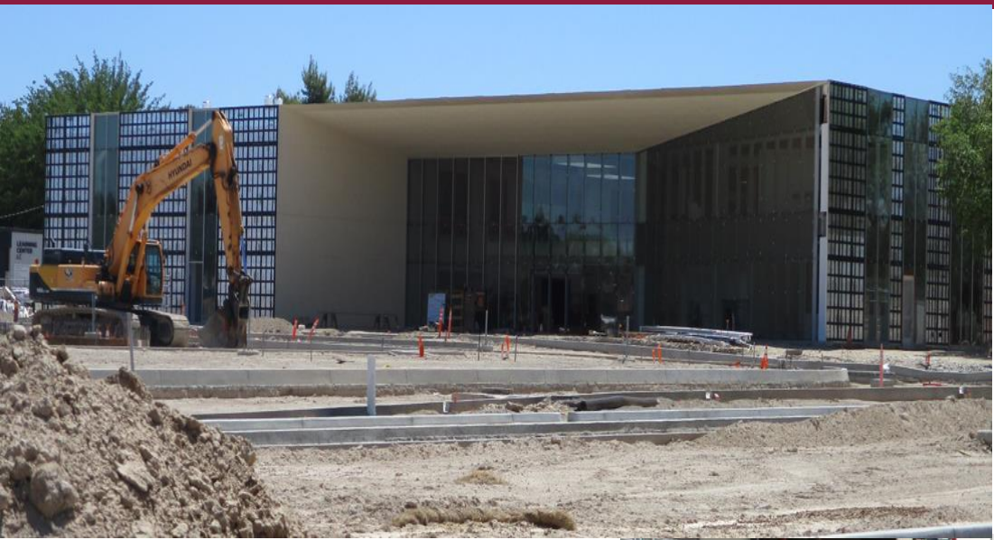
The New Front Entrance