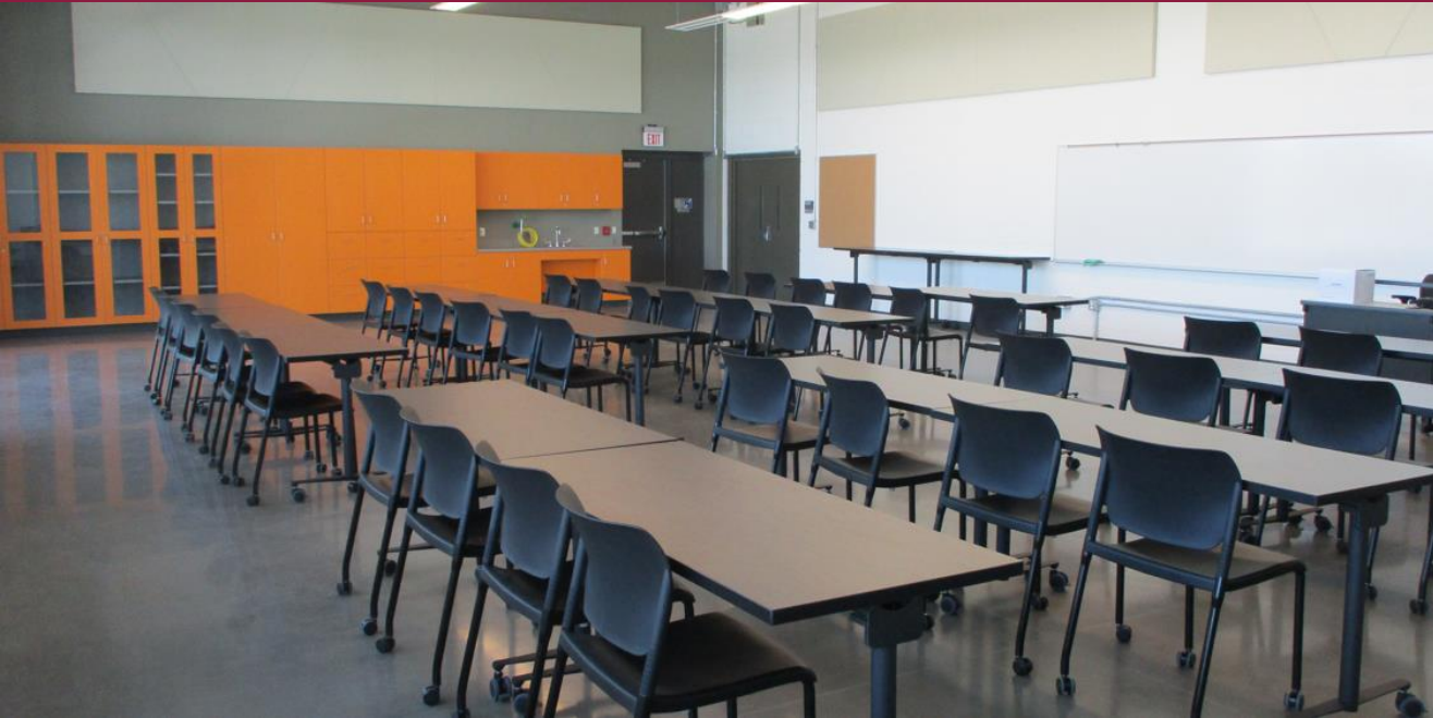
Fire Tech Classroom