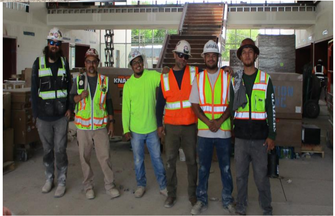
Part of the Team who are helping to make this happen!