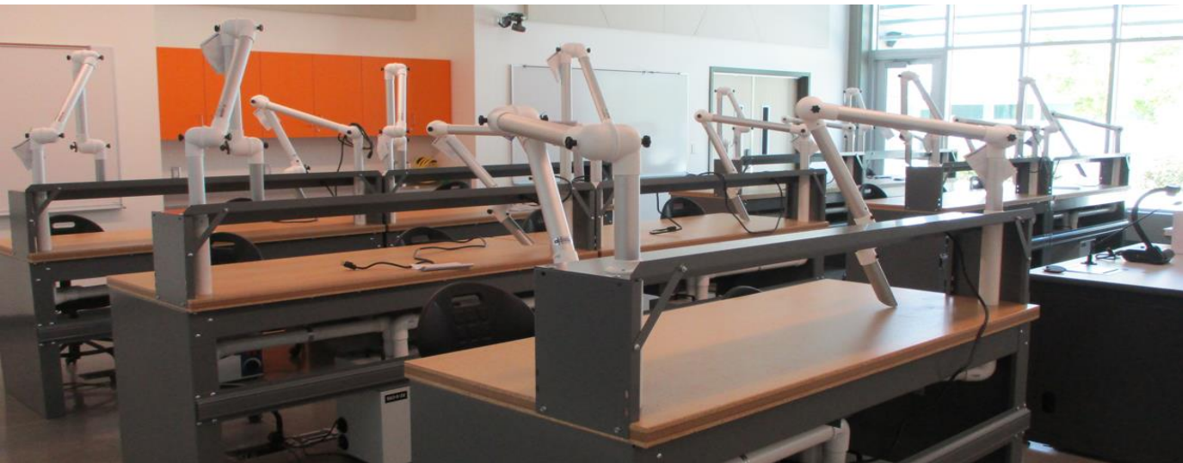
Electronics and Avionics Lab